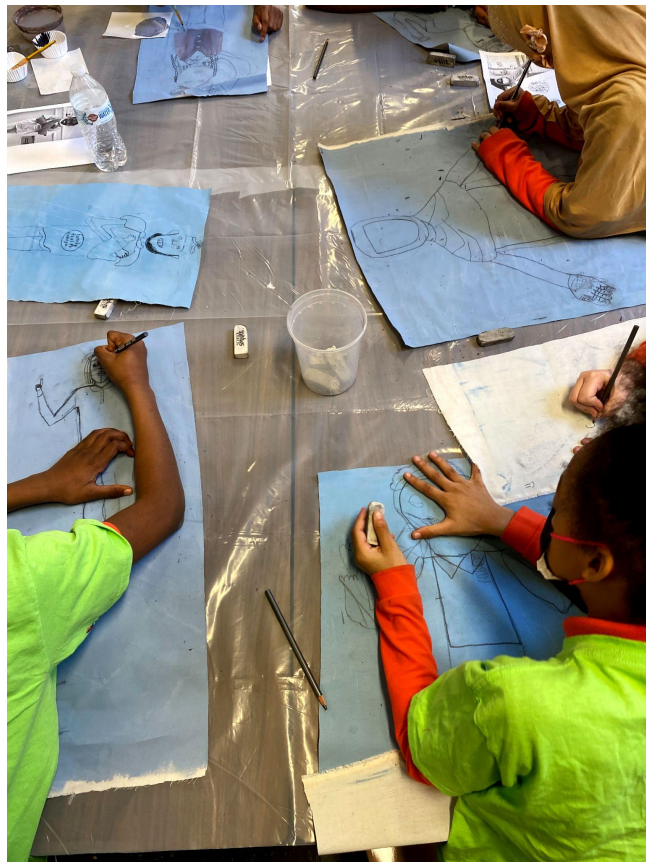
Creating murals at PS 599K