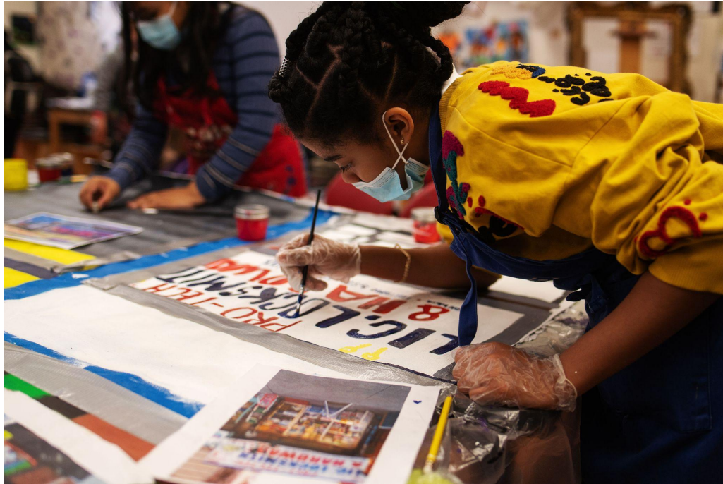
Creating murals at PS123M