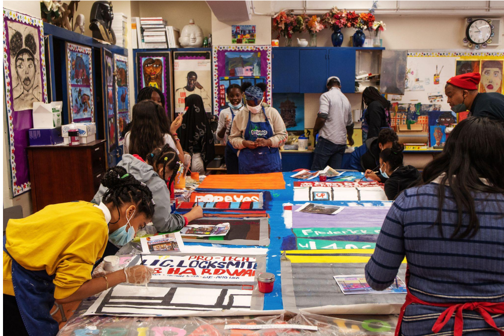
Creating murals at PS123M