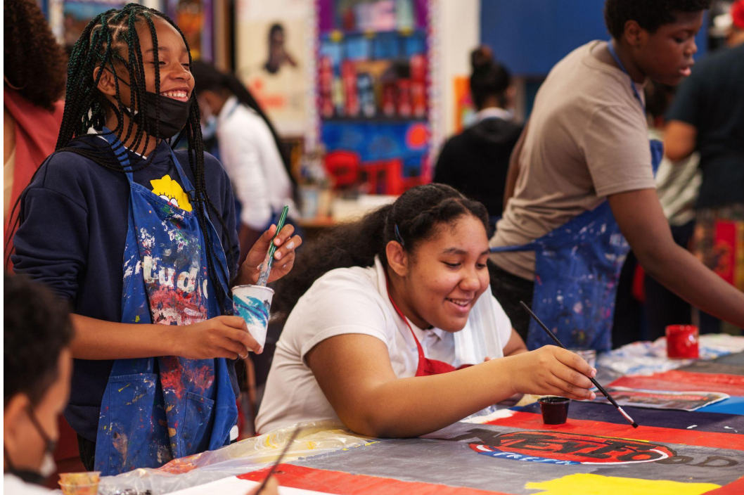
Creating murals at PS123M