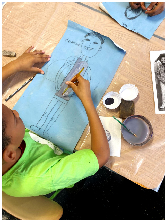
Creating murals at PS 599K