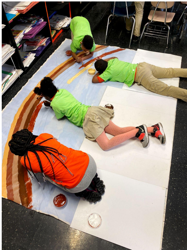
Creating murals at PS 599K