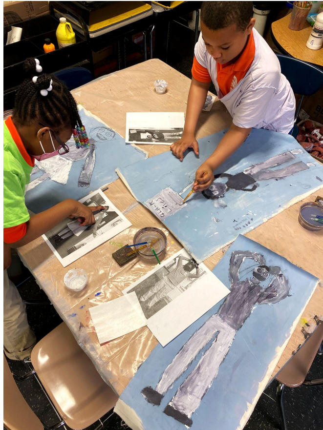
Creating murals at PS 599K