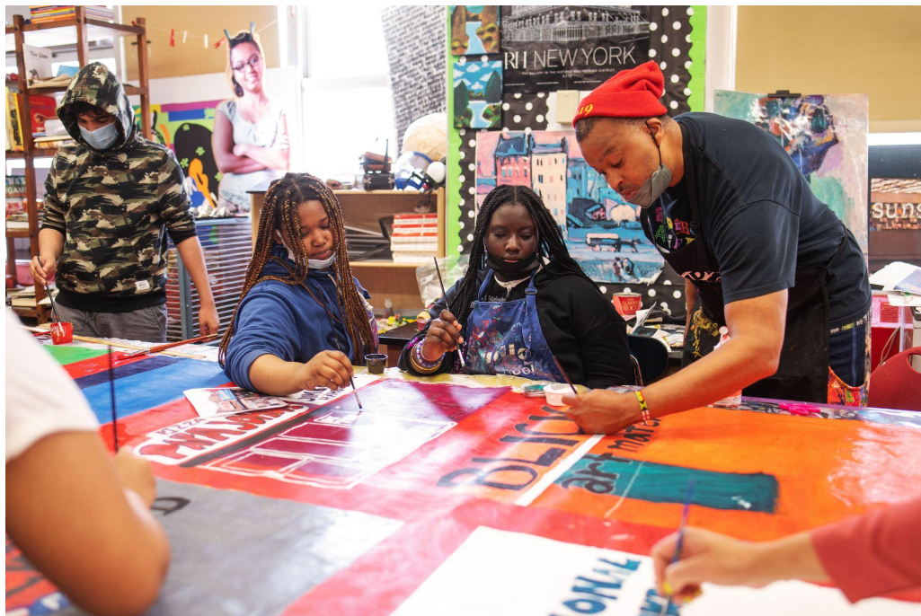
Creating murals at PS123M