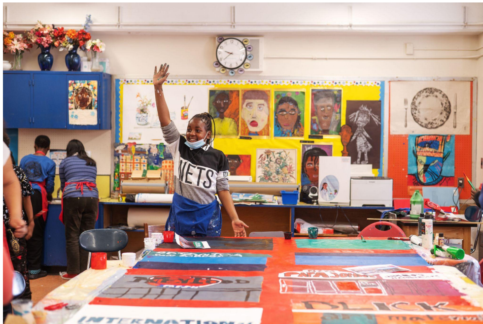
Creating murals at PS123M