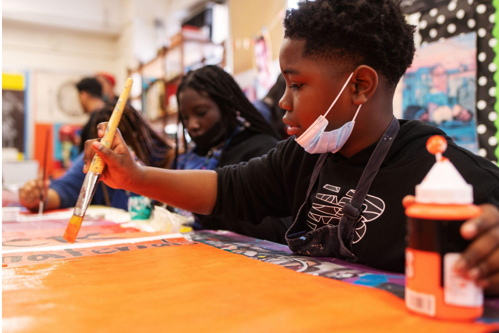
Creating murals at PS123M