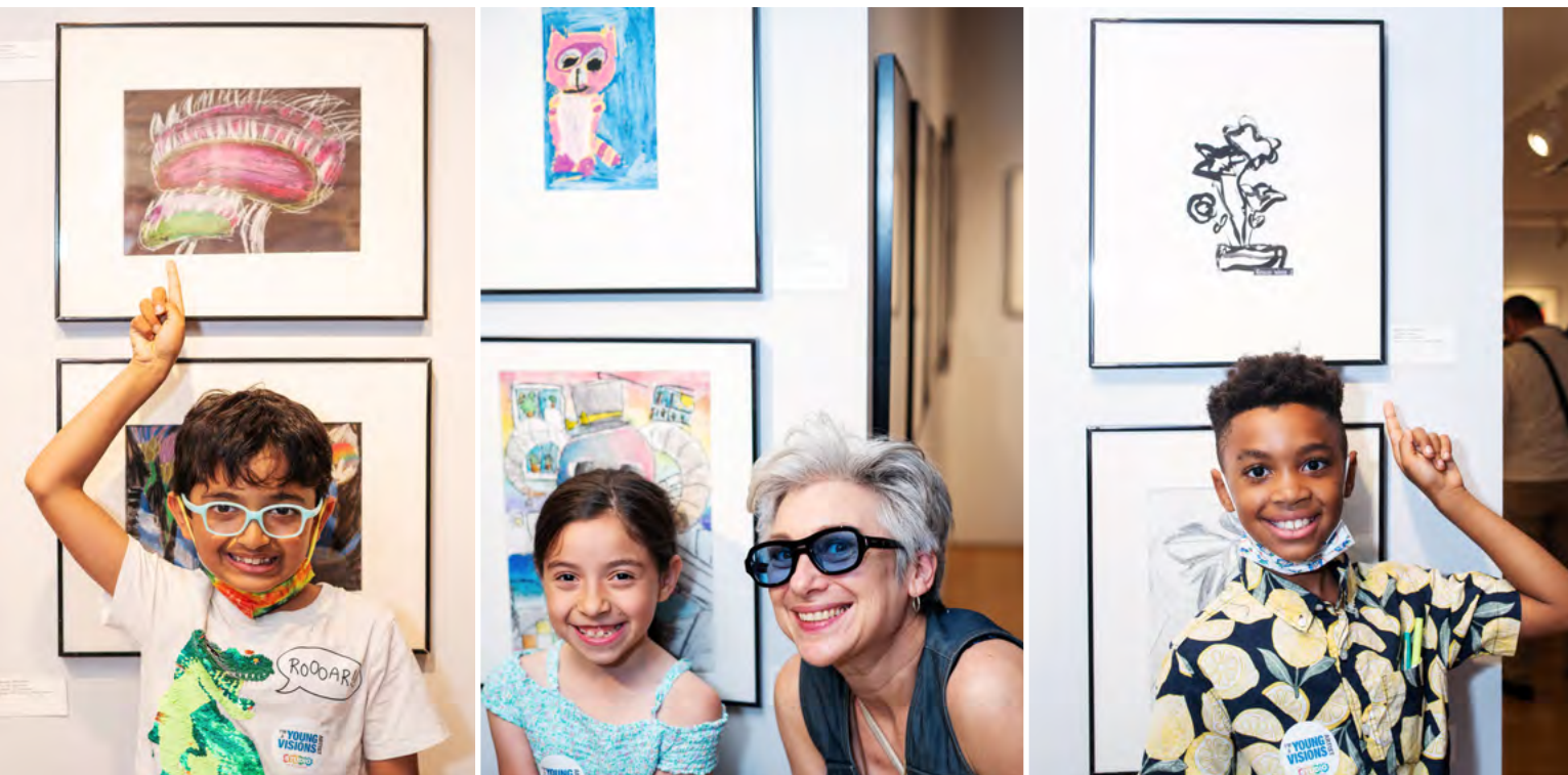
Arts education beyond the classroom exemplified by these images from Young Visions 2022 opening reception.