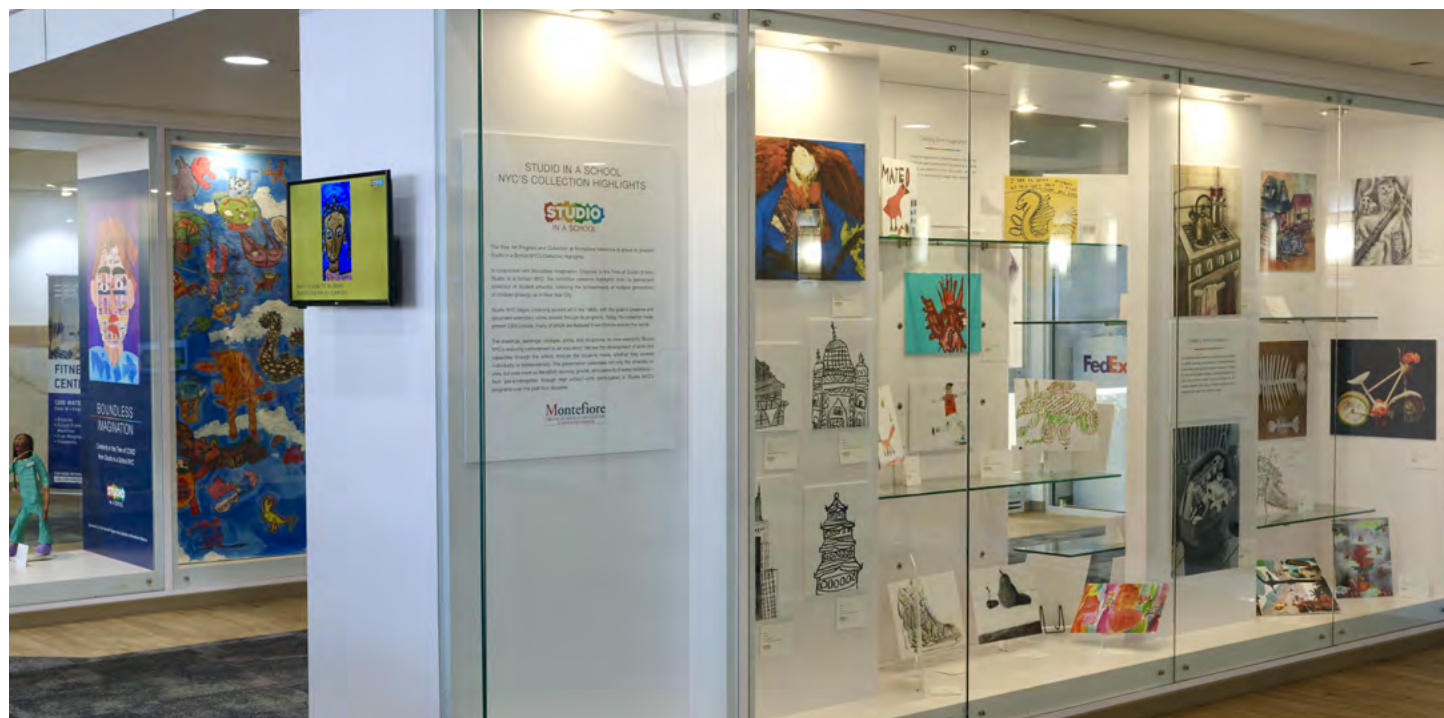
Boundless Imagination at Montefiore Einstein's Gallery of ARTful Medicine.