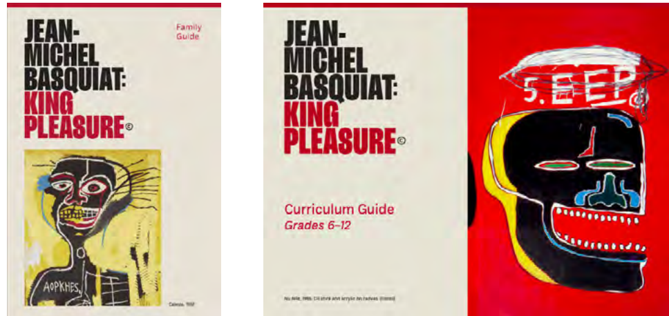
Jean Michel Basquiat: King Pleasure, Family Guide and Curriculum Guide.

Looking at Basquiat's iconic painting Nu Nile , the curriculum guide asks questions like, how does your eye move through this painting? It also shares a Nu Nile inspired art-making activity entitled Visual Rhythm, which prompts students to reflect on Basquiat's use of motifs, like the body, text, and crowns, then create their own motifs that reflect their interests, ultimately establishing a visual rhythm by repeating motifs in different ways. Studio NYC created many art-making activities, like this one, available at www.kingpleasure.basquiat.com/education .