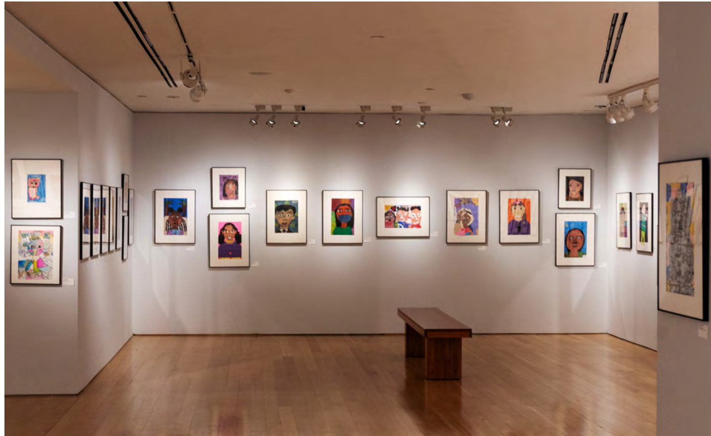
Opposite, Young Visions 2022 opening reception at Christie's New York

After shifting to online exhibitions during the pandemic, Studio's annual exhibition Young Visions 2022 returned in-person to Christie's New York. Featuring over 200 vibrant artworks, this exhibition highlighted the outstanding artistic achievements of students from our visual arts education programs. It was on view from June 8 – 14, 2022, with a festive opening reception. More than 200 guests joined us at Christie's New York to admire the artwork and celebrate!